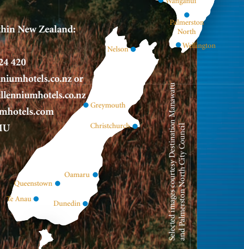
Selected images courtesy Destination Manawatu and Palmerston North City Council

Toll free reservations within New Zealand: 0800 808 228 Within Australia: 1800 124 420 Email: central.res@millenniumhotels.co.nz or kingsgate.palmerston@millenniumhotels.co.nz Website: www.millenniumhotels.com Worldwide GDS Code: MU 110 Fitzherbert Avenue, Palmerston North. PO Box 502, Palmerston North Tel: 64 6 356 8059 Fax: 64 6 356 8604