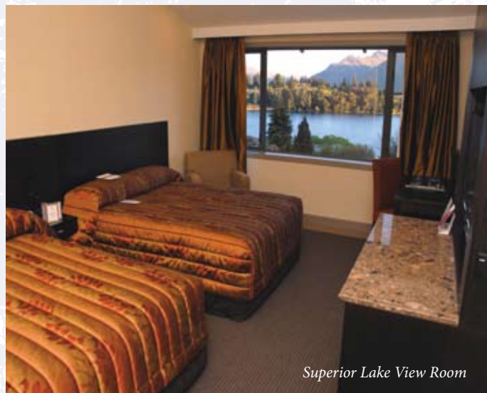
Superior Lake View Room